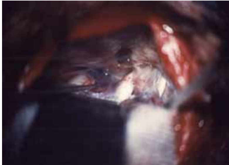
FIGURE 3 Exposure of the trigeminal and oculomotor nerves.

Radio frequency rhizotomies have become the most common ablative procedures in the treatment of trigeminal neuralgia. An electrode is inserted in the Gasserian via the same route as