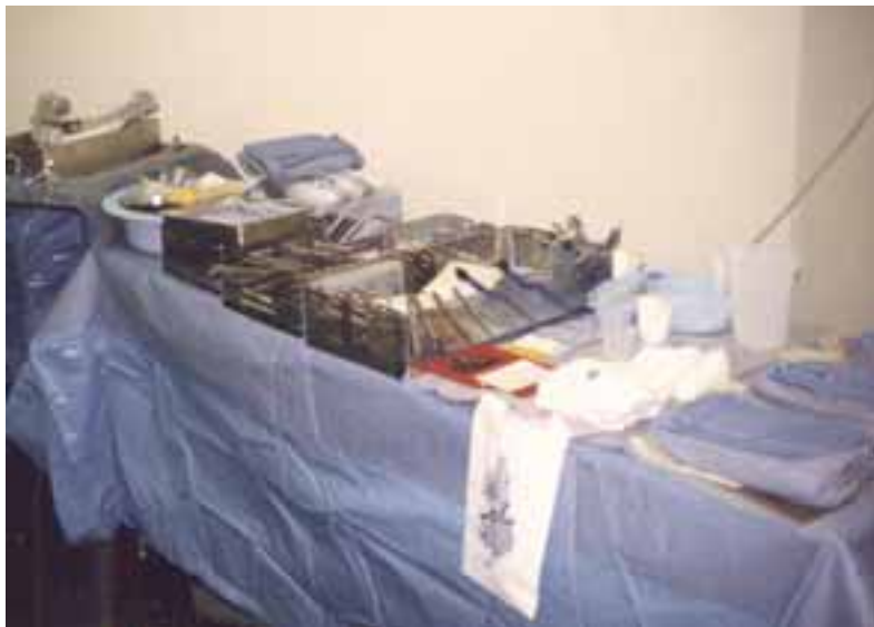
FIGURE 2 Further retraction exposes the root entry zone, along with sharp and blunt dissection. Standard craniotomy setup. Final vessel and nerve exposure are achieved using sharp dissection. The offending vessels are identified and teased away into a horizontal position. This can be accomplished using a variety of microdissectors, microscissors, and microforceps. Extreme care must be taken not to manipulate the vessels too much, causing vasospasm. Alternatively, Gelfoam® soaked in papaverine can help prevent this from occurring.

Cerebrospinal fluid is evacuated from the subarachnoid space using gentle suction, facilitating the brain retraction and exposure. Any arachnoid fibers are divided by sharp dissection using an arachnoid knife and microscissors. The retractors are further advanced on top of the cerebellum, exposing the lateral portions of the trigeminal and oculomotor nerves (Figure 3).