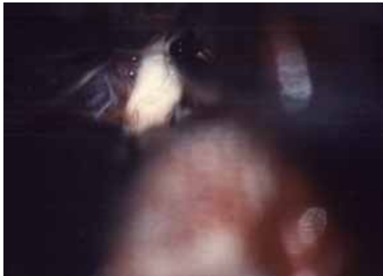
FIGURE 4 After decompression, an indentation in the nerve is still visible.