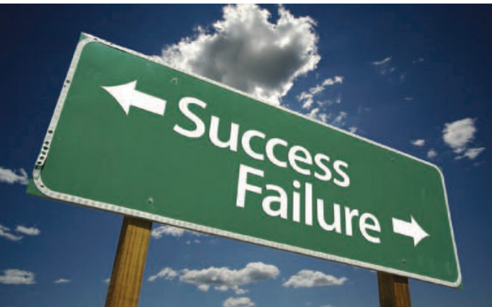
Maslow's hierarchy is a two-way street. A person can spend a lifetime traveling between the two extremes.

It is amazing that all of the prior needs within Maslow's hierarchy, including physiological, safety, and even belongingness needs are frequently met, especially in modern society and developed countries. Imagine if more people just had a little respect for themselves in the grand scheme of things.