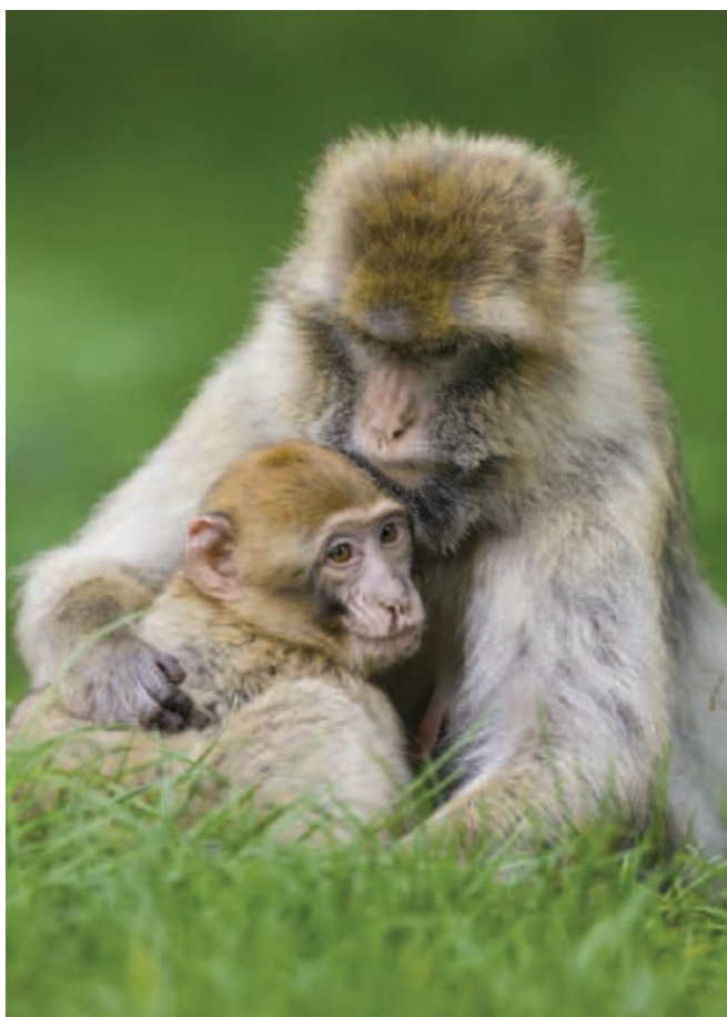
The basic principles of Maslow's hierarchy have been observed in primates.