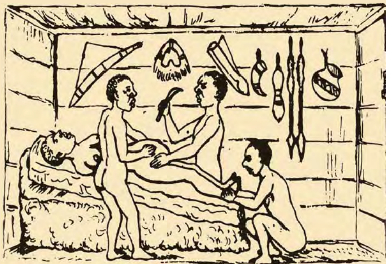
Figure 1. Successful Cesarean section performed by indigenous healers in Kahura, Uganda. As observed by RW Felkin in 1879.

neonate when a mother is dying is great, and can happen in an instant and in a labor and delivery room (LDR) setting. Sometimes, the delivery must be performed immediately after maternal death. A Cesarean delivery in the LDR is the delivery of a neonate by means of an incision into the uterus in a life-threatening emergency. Every surgical technologist who works in labor and delivery needs to be prepared for any and all emergencies.