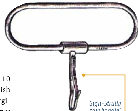
Gigli-Sturly saw handle*

A forced-air warming blanket is used to cover the parts of the body not involved in the surgery. Trauma patients' temperature needs to be stabilized to decrease the risk of hypothermia and the risk it can have on the heart and post-operative healing. A pneumatic tourniquet is applied to the affected limb to reduce blood loss during surgery. Inflation time of the tourniquet needs to be annotated and tracked. The surgical technologist or circulator should notify the surgeon once the tourniquet has been on for an hour. Inflation time should not exceed one and a half hours at 300-350 mmHg on a lower extremity. If the surgery takes longer, the site should be covered and the tourniquet deflated for approximately 10 minutes to re-establish blood flow. Electrosurgical and suction machines