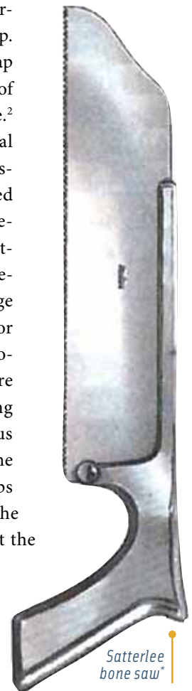
Satterlee bone saw*

After the time out check list is completed, the surgeon uses a #10 knife blade to make a V-shaped incision in the anterior-posterior plane above the distal femur to get the greatest skin length possible. This flap will provide for easy coverage and tension-free closure of the stump. The surgical technologist should have lap sponges available to keep the site clear of fluids and decrease the risk of exposure. 2 To control bleeding, the electro-surgical pencil will be used to coagulate open vessels. Sharp and blunt dissection is carried down to the muscular layer. The posterior, lateral and anterior muscle compartments are identified and isolated to create musculocutaneous flaps for coverage of the femoral stump. The distal adductor canal is entered and the superficial femoral artery, vein and saphenous nerve are all ligated and divided separately. Tying vessels separately prevents arteriovenous fistulas or aneurysms from forming. The surgical technologist should have clamps and nonabsorbable ties available for the surgeon to doubly clamp, ligate and cut the identified vessels. Muscles are further transected circumferentially with a #10 blade. The sciatic nerve is held with a Schnidt clamp, cut and ligated with the electro-surgical