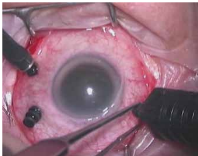
Three ports are used for the vitrectomy surgery. One is for the infusion used to maintain the globe. This port connects to a special adaptor and fine 20-gauge tubing that connects to a stopcock. The three-way stopcock connects the infusion port in the eye to the macro drip tubing to a bottle of BSS, and the third port is for an air line if one is needed.