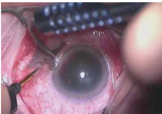
The trocar blade and cannula are inserted into the globe 3-3.5 mm from the limbus.