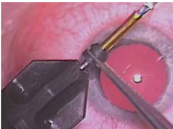
The trocar blade and outside cannula are held with a trocar cannula forceps.