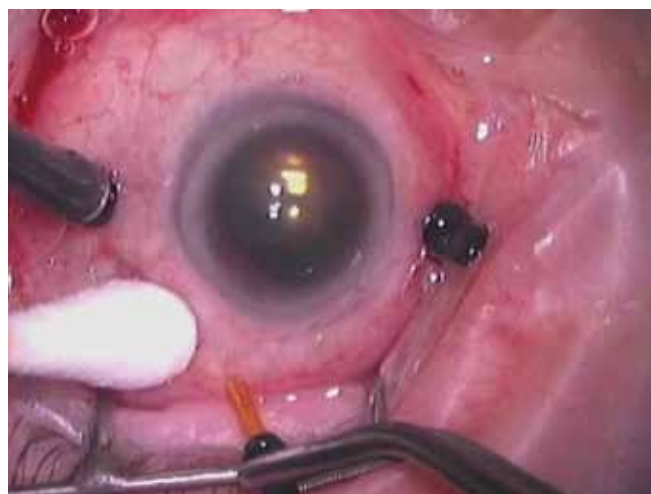
Removal of the cannulas using Nugent forceps.