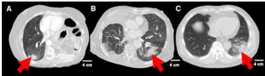
Figure 2. Examples of radiographic changes that may benefit from being distinguished using artificial intelligence

Representative non-contrast computed tomography slices showing patients who experienced (A) radiation pneumonitis, (B) immunotherapy pneumonitis, or (C) disease progression following cancer treatment are shown. The similarity of these images exemplify an area in which artificial intelligence might help providers distinguish subtle differences in imaging to make the correct diagnosis.