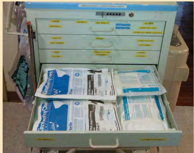
Figure 3. Cesarean section “Code Blue” cart at NYHQ

and tests performed. The nurse must also record times of event and activities of Code Blue/Response Code, recording as each team member arrives. He or she will always ask names of personnel in attendance, and will fill out a debriefing form.