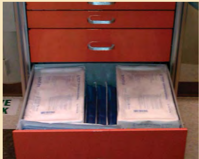
Figure 2. The anesthesia cart at NYHQ.