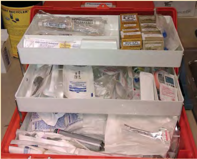
Figure 4. The neonatal box at NYHQ.

technologist should be moving as quickly as possible and must always know where the blade is. All sharp and metal objects should be removed from the field, if possible, before the delivery.