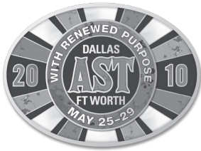
Exhibit space application and contract

Association of Surgical Technologists Annual Meeting • May 25-29, 2010