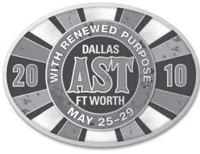
Exhibit space application and contract

Association of Surgical Technologists Annual Meeting • May 25-29, 2010