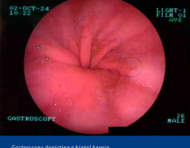
Gastroscopy depicting a hiatal hernia.

In a fundoplication, the gastric fundus of the stomach is plicated around the lower end of the esophagus and stitched in place, reinforcing the closing function of the lower esophageal sphincter. The esophageal hiatus is narrowed down by sutures to prevent or treat concurrent hiatal hernia, in which the fundus slides up through the enlarged esophageal hiatus of the diaphragm.