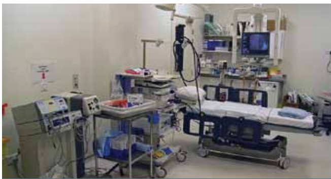
An endoscopic surgery operation room.

Following these basic operative steps, researchers have been able to trial the effectiveness of NOTES in a variety of surgical cases ranging from peritoneal endoscopy, to transvaginal cholecystectomy, to transgastric gastrojejunostomy and splenectomy. 19 This new “scarless” approach to operative and diagnostic therapy is a combination of both endoscopic and laparoscopic techniques and is currently in its experimental/developmental phase. 14 Much of the research has been conducted using animals such as canine and porcine models since Kalloo et al performed the first transgastric peritoneal exploration on a pig in 2004. 20 However, human trials have been conducted to a minimal extent and largely have been confined to transgastric appendectomies performed in Hyderabad, India, by GV Rao, MD, and Nageshwar Reddy, MD. 19 Data related to these human trials of NOTES technology are limited at best. The tremendous interest in this tech-