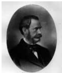
John Collins Warren, MD