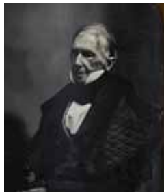
William TG Morton

laid the foundation for modern operative intervention aided by the administration of anesthetic agents. 9 Since that time, the use of general anesthe-