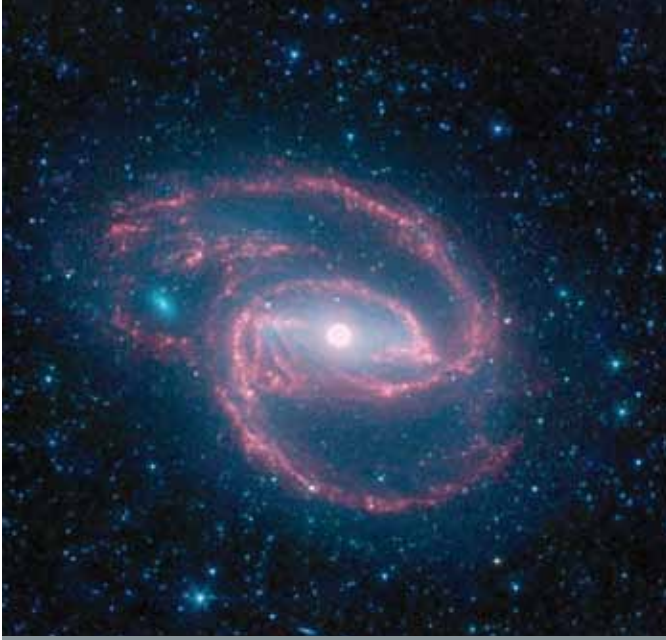
NASA's Spitzer Space Telescope has imaged a coiled galaxy with an eyelike object at its center. The 'eye' at the center of the galaxy is actually a monstrous black hole surrounded by a ring of stars. In this color-coded infrared view from Spitzer, the area around the invisible black hole is blue and the ring of stars, white.

The most common medical condition experienced by astronauts is space motion sickness.