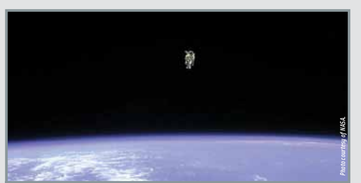
At about 100 meters from the cargo bay of the space shuttle Challenger, Bruce McCandless II was further out than anyone had ever been before. Guided by a Manned Maneuvering Unit (MMU), astronaut McCandless, pictured above, was floating free in space. McCandless and fellow NASA astronaut Robert Stewart were the first to experience such an "untethered space walk" during Space Shuttle mission 41-B in 1984. The MMU works by shooting jets of nitrogen and has since been used to help deploy and retrieve satellites. With a mass over 140 kilograms, a MMU is heavy on Earth, but, like everything, is weightless when drifting in orbit. The MMU was replaced with the SAFER backpack propulsion unit.

Breast Biopsy system uses CCDs as part of a digital camera system. The device can view breast tissue more clearly and efficiently that any other existing technologies and are so advanced that they can detect the smallest differences between malignant or benign tumors without a biopsy. Since more than 500,000 women every year need breast biopsies, this technology has not only allowed for a less invasive and traumatic procedure, but has created economic benefits as well by reducing the cost and time of the procedure.