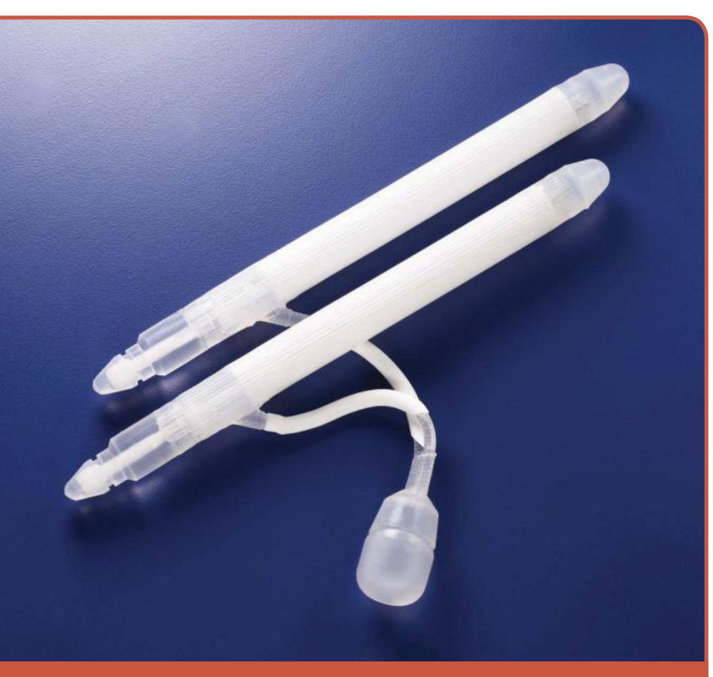
Ambicor Penile Prosthesis

the four blue towels were placed by the surgeon, the surgical technologist grabbed and passed the drape. A laparotomy drape was placed on the surgical site; the bottom of the drape was extended over the patient's lower extremities and then the top of the drape was extended toward the patient's head. The anesthesiologist secured both sides of the drape to the IV poles.