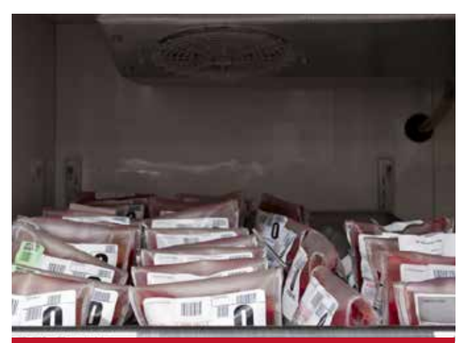
Blood or platelets need to be ready at all times during surgical procedures on VWD patients

and is the most common appearing in 70% to 80% of the cases.11 With type 1, patients will have mild to moderately severe bleeding. There also is a partial quantitative deficiency of von Willebrand factor. With type 1, all multimers are present and in same proportion, but reduced. Factor VIII, von Willebrand factor activity and von Willebrand factor antigen can be reduced or around the normal range. Type one von Willebrand disease is the least dangerous, but will require test of the clotting factors prior to any surgery or dental work. If there is a deficiency, then the patient should be treated with desmopressin, and then rechecked for clotting factors.4