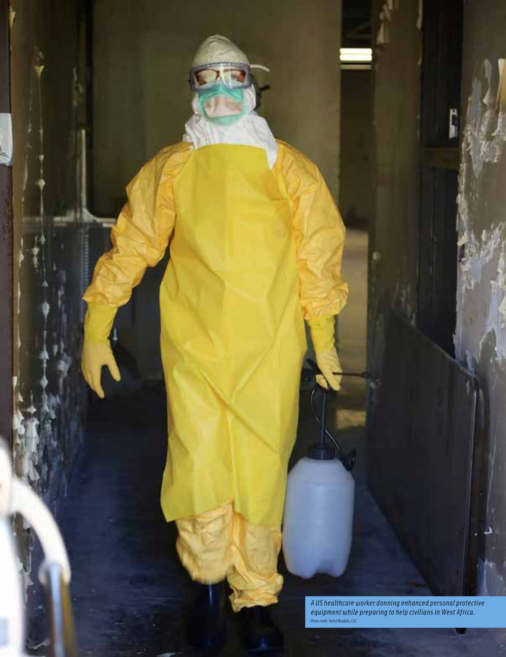
A US healthcare worker donning enhanced personal protective equipment while preparing to help civilians in West Africa.