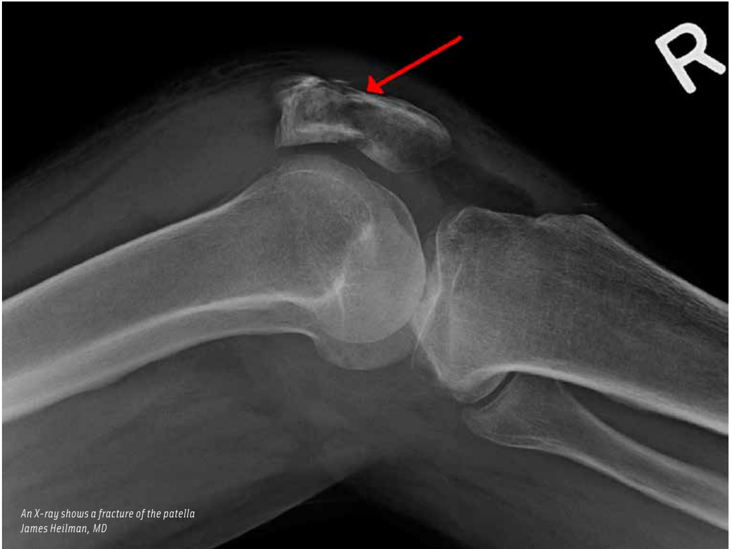
An X-ray shows a fracture of the patella

should be more articular than anterior in the patella bone.