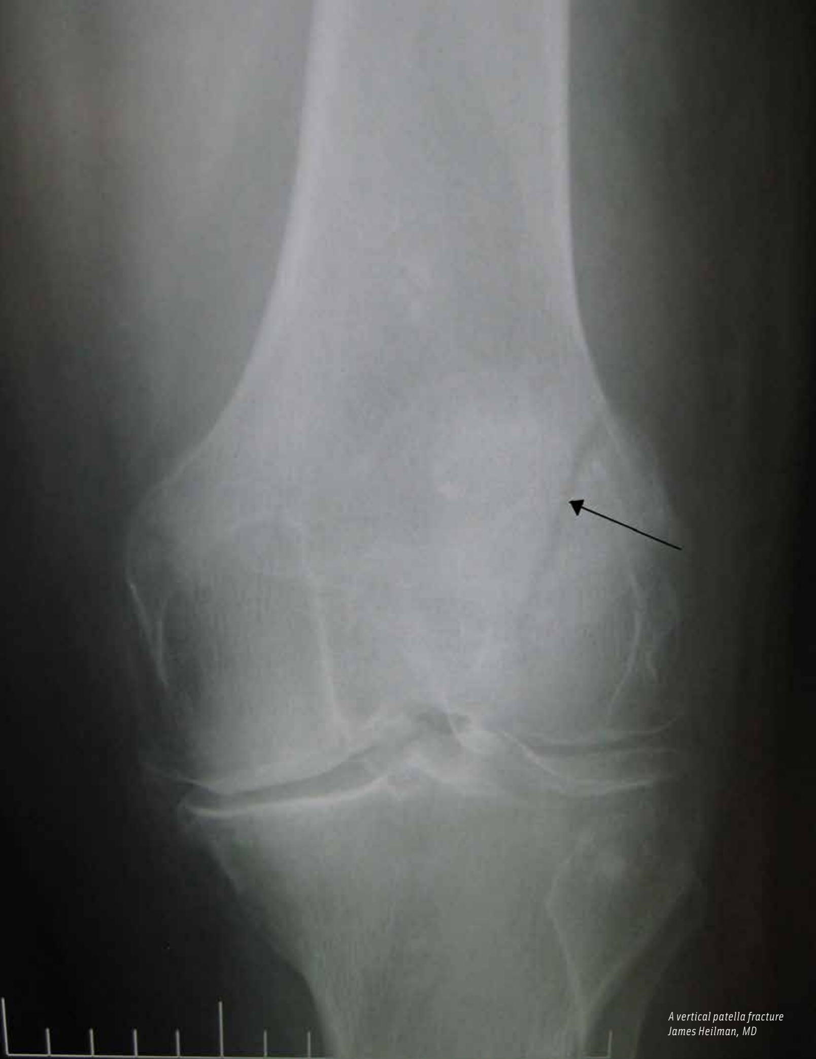
A vertical patella fracture