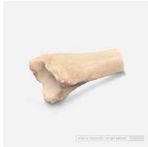
Figure 4. A fresh distal tibial osteochondral allograft.

Generally, fresh OCA transplantation in the knee yields promising results. In 1 study, midterm outcome analysis of OCA transplantation with or without concomitant procedures revealed an 87% graft survival rate at 5 years with a 37% reoperation rate, which was primarily arthroscopic debridement. 21 A systematic review by Assenmacher et al 4 that included 291 patients across 5 studies with OCA transplantation in the knee found a failure rate of 25% at an average follow-up of 12.3 years. They also identified patients younger than 35 years, male sex, and transplanted grafts smaller than 2 cm 2 as predictors of more favorable outcomes, as well as the tendency for grafts transplanted to the patellofemoral compartment to be less successful. 4 Further, the literature on return to play (RTP) after OCA transplantation reads favorably. One study examined 13 high-level, high school, intercollegiate, and professional athletes (15 knees) who underwent femoral condyle OCA transplantation with an average follow-up of 5.9 years. The study reported that 7 athletes (54%) returned to competitive sports at an average of 7.9 months. An adjusted RTP rate of 77% was calculated when graduation was taken into account as the chief reason for not returning to the preinjury level of competitive sport. 42