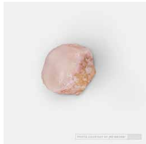
Figure 2. A fresh patellar osteochondral allograft.

notes, or surgical notes are electronically forwarded to the insurance company, along with a completed cover sheet where appropriate International Classification of Diseases–10 and Current Procedural Terminology codes are denoted. The cover sheet is often a preformed template provided by the insurance company. Once the insurance company provides a written statement agreeing that the procedure is indeed medically necessary and covered by the patient's plan, the surgeon should unimpededly move forward with the allograft ordering process.