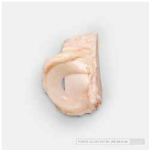
Figure 5. A fresh-frozen lateral meniscal allograft.

Riff et al 53 reported on midterm outcomes of fresh humeral head OCA transplantation in 18 patients. With an average follow-up of 66.5 months, they described 7 failures (39%), including 4 conversions to total shoulder arthroplasty (22%). Eleven patients (61%) expressed satisfaction and stated they would undergo the procedure again, while postoperative radiographic analysis at an average of 14.8 months revealed that 90% of grafts were incorporated. 53 A cohort of 27 male patients who underwent fresh distal tibial allograft reconstruction of the glenoid underwent postoperative clinical and radiographic evaluation at an average of 45 and 17 months, respectively. Investigators found excellent clinical results with respect to patient-reported outcomes and joint stability, as well as an 89% healing rate as seen on CT, with a 3% average allograft lysis rate. 51