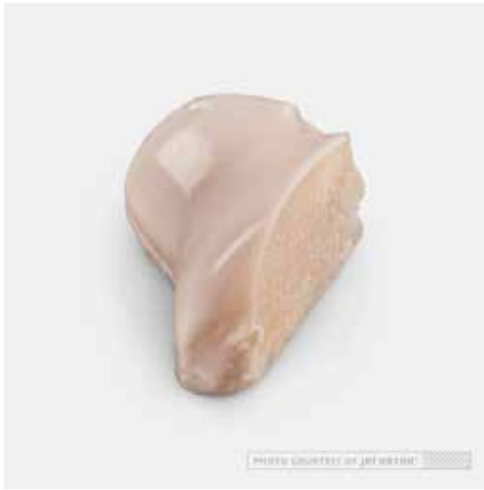
Figure 3. A fresh femoral trochlear osteochondral allograft.

In order for the tissue bank to select and distribute a size-matched allograft, the surgeon must provide an anteroposterior (AP) radiograph that includes a sizing marker, allowing the distributor to calculate the image's magnification. 56 A lateral view radiograph of the index knee at the level of the tibia, directly below and parallel to the joint line, should also be obtained and provided to the tissue bank. 24 Magnetic resonance imaging (MRI) provides the surgeons with a second option, although studies have shown that MRI has the potential to underestimate the size of the lesion. 56 Visualization of subchondral involvement and/or edema in the lesion can be gained through cartilage-specific MRI, whereas bone scintigraphy can be used to evaluate the compartment overload, particularly in patients who have undergone prior meniscectomy. 56