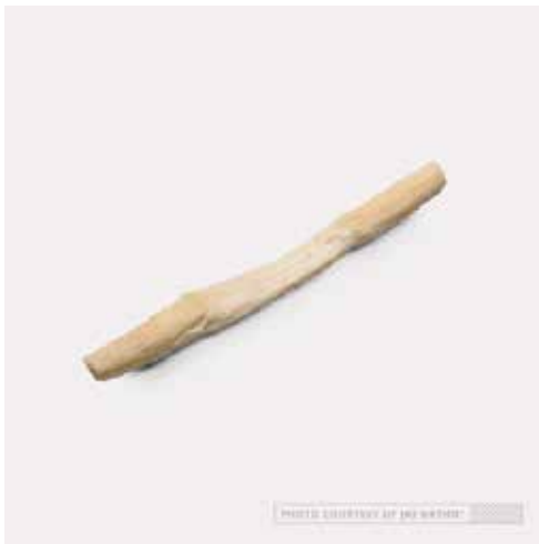
Figure 7. A preshaped bone–patellar tendon–bone allograft.

semitendinosus, gracilis, Achilles tendon (Figure 6), and patellar tendon (Figure 7), with the last 2 representing the most commonly utilized. 54 The ordering process for soft ligament allografts mirrors that of fresh OCAs with the exception of including radiographs for size matching. 4,34 For simplicity, this section focuses on information pertaining to allografts used in ACL reconstruction.