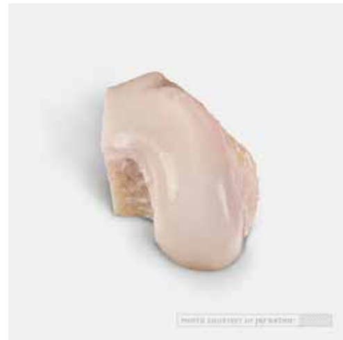
Figure 1. A fresh lateral femoral hemicondylar osteochondral allograft.

Despite some degree of variation from company to company, tissue banks maintain a relatively simple and uniform process of fresh OCA order submission. Once the decision-making process has concluded and the surgeon is prepared to order the graft from a tissue bank, the surgeon must provide the tissue bank with a form denoting the desired graft (eg, a distal tibia or a femoral condyle), along with laterality and the procedure to be performed, oftentimes in addition to the patient's sex and basic biometric data. This form, along with the radiographs discussed later that allow for size matching, may be submitted electronically using a website account or via paper mail. 4,34 It is important to note, nevertheless, that the surgeons and their staff may need to work with the patient to obtain prior authorization from the patient's insurance provider before placing the allograft order. Given that the fresh OCA transplantation is a relatively new procedure compared with, for example, a total knee arthroplasty (TKA), insurance companies often require that their own medical team review the patient's records before the procedure is deemed medically necessary. For this review to take place, it is generally necessary that any relevant previous imaging, consultation