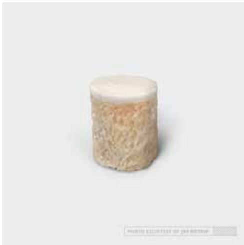
Figure 8. A fresh osteochondral allograft core.

Chondrofix is another off-the-shelf OCA and was introduced in 2012 for single-stage treatment of full-thickness articular cartilage lesions. The decellularized bone-cartilage construct is cylindrical, precut to a depth of 10 mm, and is available in diameters of 7, 9, 11, and 15 mm. The shelf life for Chondrofix is 24 months when stored at 40°C or less and it should never be frozen. In 2016, Farr et al 18 reported discouraging preliminary data on patients treated with Chondrofix. A 72% failure rate was noted among the 32 knees treated in the series at a mean follow-up of 1.29 years. The average defect size of the cohort was 2.9 \pm 2.0 \text{ cm}^2 with a median of 2 allografts implanted per knee.