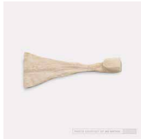
Figure 6. An Achilles tendon allograft.

Fresh-frozen meniscal allografts are obtained from tissue banks in a fashion similar to the process by which fresh OCAs are obtained, as detailed above. Meniscal defect dimensions are quantified using AP and lateral radiographs with size-matched magnification markers, and an appropriate graft can be selected and distributed by tissue banks using this imaging. 29,50 In contrast to OCAs, however, fresh-frozen meniscal allografts can be stored indefinitely at -80^{\circ}\text{C} and, before usage, thawed in a water bath at a temperature of 37^{\circ}\text{C} before being removed from its package and placed in a sterile saline solution. 17 These allografts are typically sourced from donors younger than 45