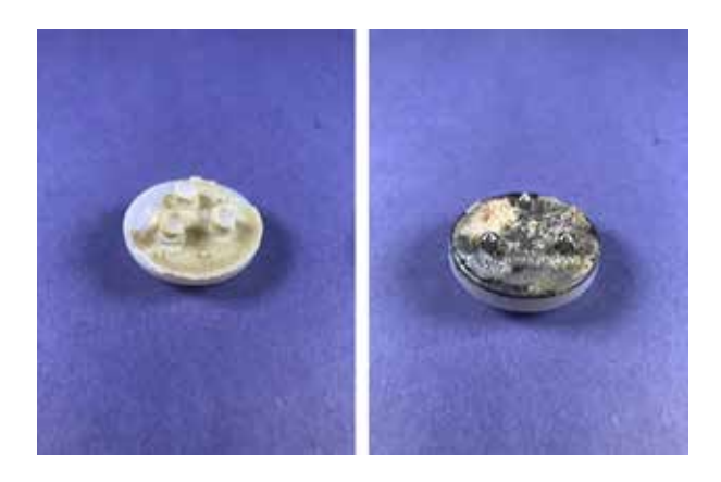
Fig. 2 Two explanted patellar components: a cemented patellar component (left) and a porous metal-backed patellar component (right).

In 2002, Valdivia et al compared midterm results between press-fit and cemented patellar components. Radiographic data showed that the incidence of maltracking was significantly higher with cement fixation, but the two components provided equivalent clinical results.<sup>114</sup>