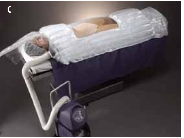
PHOTO Bair Hugger®.

patient directly, placing a sheet between the patient and the blanket (Figures 1 and 2). It is optimal to combine the use of a hyperhypothermia blanket with foil blankets that go over the patient.