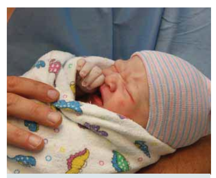
After it has been determined the infant has a good bill of health, it is swaddled and prepared to meet his or her mother

The next layer, "the abdominal muscles, are usually left open as well because they too usually fall together by themselves."6 However, tying them together at spots along their lengths can be done using a 2-0 or 3-0 polyglactin 910 suture. The fascia layer is the most important layer to close since it is the support layer for the abdomen. This layer needs to be closed with a thicker, more durable suture such as 0 polydioxanone or 0 polyglactin 910 suture. A full count is done with the circulator at this point, which consists of sponges, needles, blades, Bovie tip and instruments.