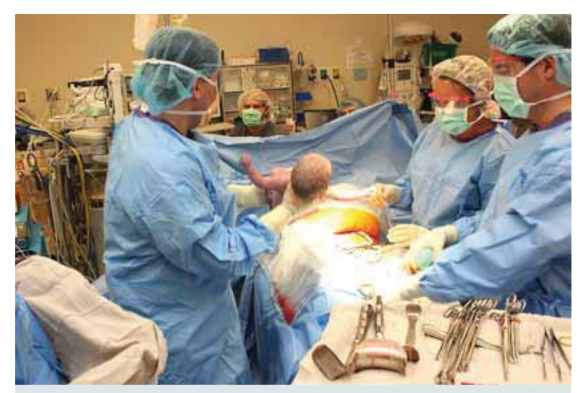
Once the baby is delivered, the newborn is handed to a neonatal nurse and/or pediatrician and the infant is assessed

The uterine incision is then closed typically using a a