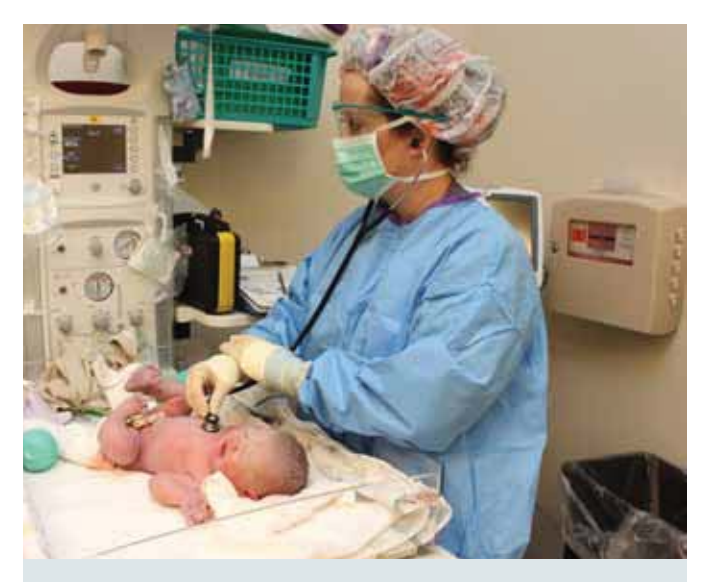
The newborn has its vitals assessed as it lays on an infant warmer