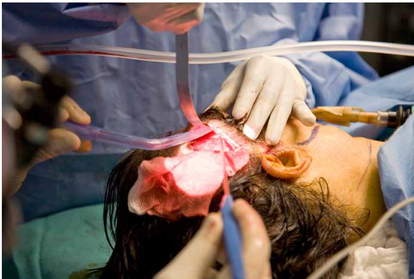
A face-lift operation is performed

is no circulating nurse or anesthesiologist present. Prior to the procedure, the surgical technologist witnesses that the consent form has been signed and counter signs it. He or she also reviews all medical entries at this time. Vital signs, including blood pressure and pulse oximeter readings, are recorded and close attention is given to any irregularities, such as cardiac dysrhythmia, that could indicate a potential medical risk.